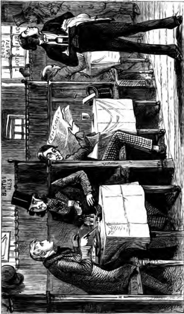
The bitter bit. —p. 198